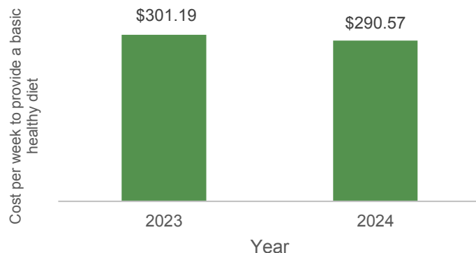
Cost of a nutritious food basket for a family of four for one week, Halton Region, 2023 and 2024