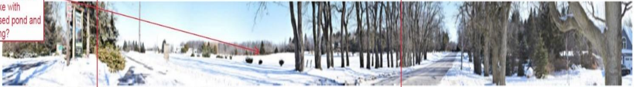
Photo 32: 5234 Cedar Springs Road. Facing Towards Proposed Western Extension.

What will this view look like with proposed pond and berming?