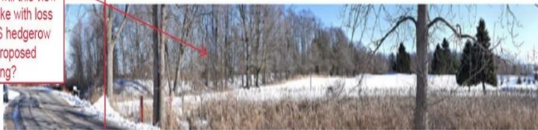
Photo 43: 2129, 2139 Colling Road. Facing Towards Proposed Western Extension.

What will this view look like with loss of N-S hedgerow and proposed berming?