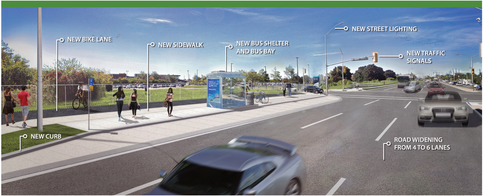
Future rendering – Sheridan College at Ceremonial Road.