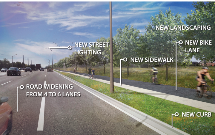
Future rendering – Southbound Trafalgar Road lanes between Glenashton Dr. and Rosegate Way.