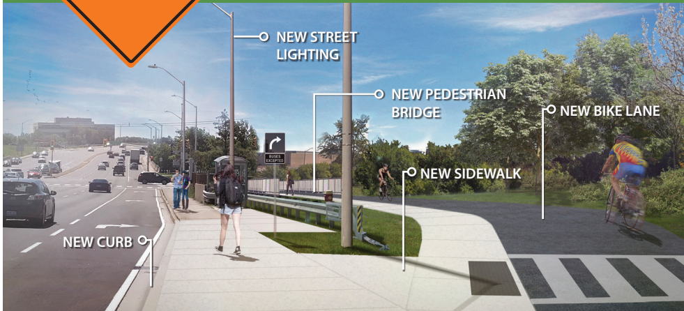
Future rendering – Southbound Trafalgar Road lanes north of Leighland Avenue.